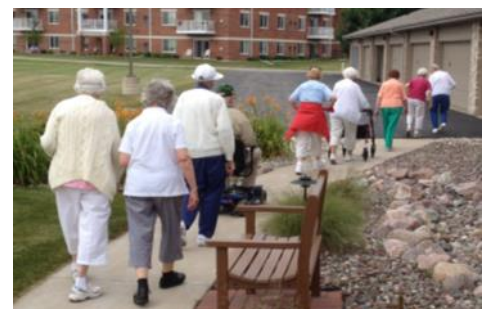
Valley VNA's Walking Club